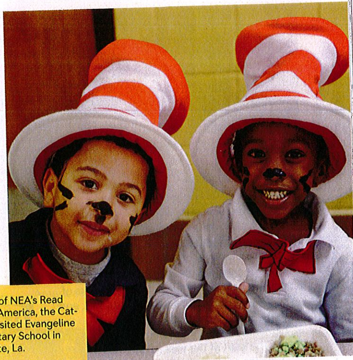
As part of NEA's Read Across America, the Cat-a-Van visited Evangeline Elementary School in Lafayette, La.